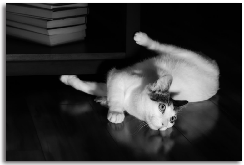
2<sup>nd</sup> "Playful Pugsley" Denice Loria Woyski