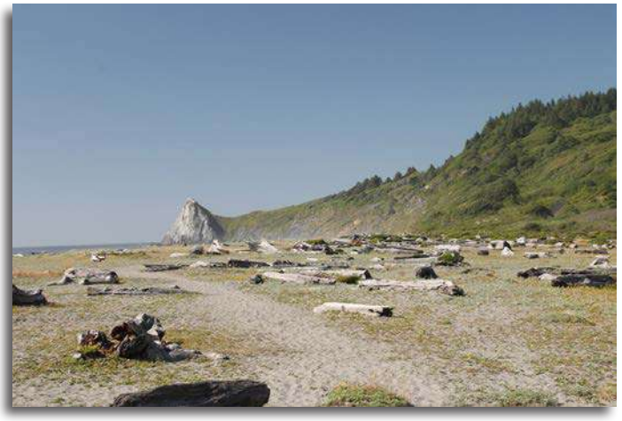
"Little River State Beach, Humboldt County"

in the picture to get everything in the picture, or should I zoom in on something particularly interesting. There is no easy answer, as each location tells me what is the best way to photograph this. However, these decisions are mostly made after the fact, causing me to choose between multiple shots of the same place, shots I'd taken months or even years before. Often it comes