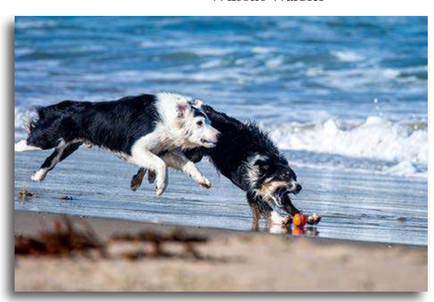
"Two Border Collies at Play at Beach"