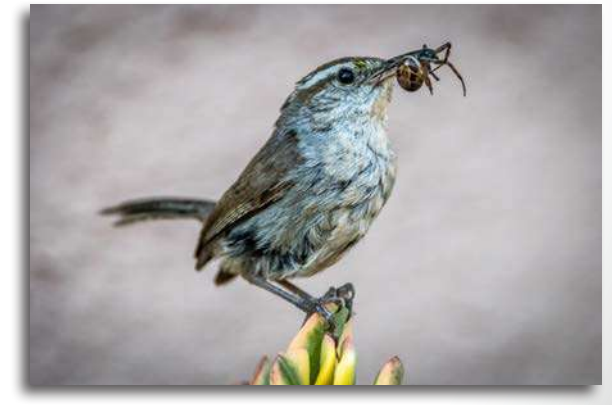
"Bewick's Wren with Bug"