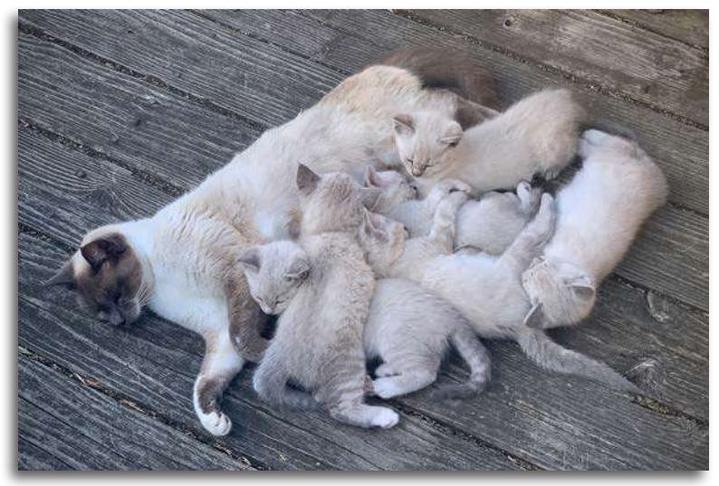
HM "The White Sextuplet Kittens" Kent Van Vuren