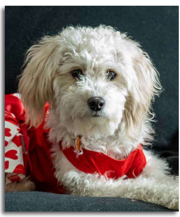
HM "Zoe" Dick Light