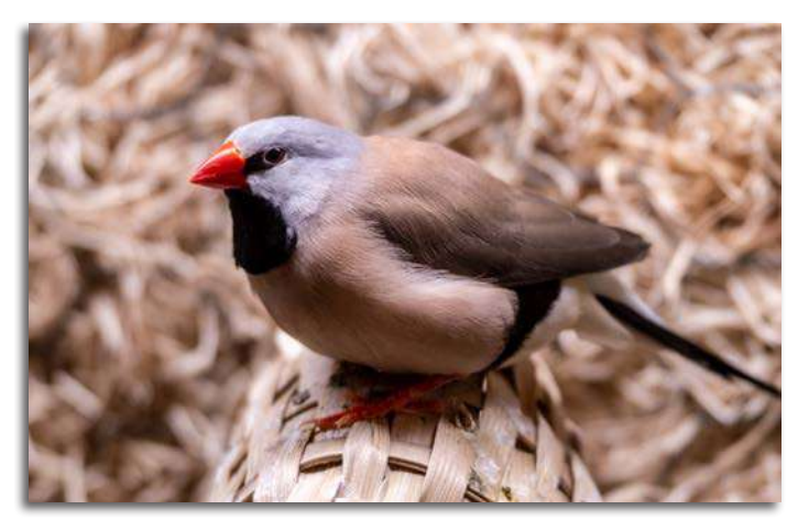
HM "Finch in Glass Cage" Dick Light