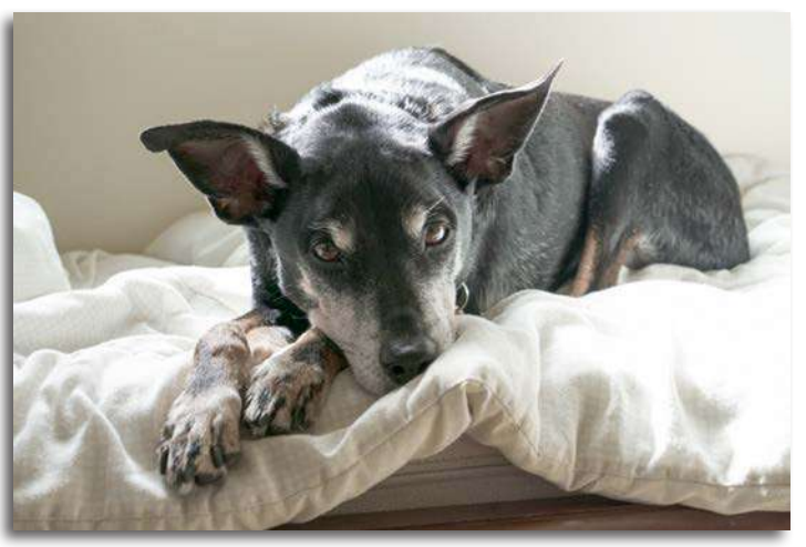
2<sup>nd</sup> "Contented" Carole Gan