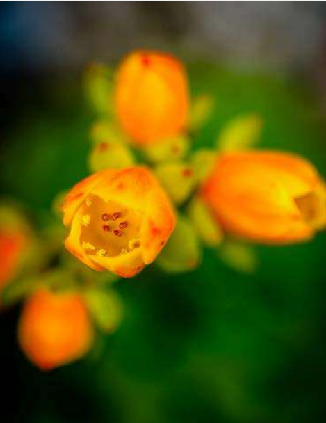
"Yellow Mai Flower"