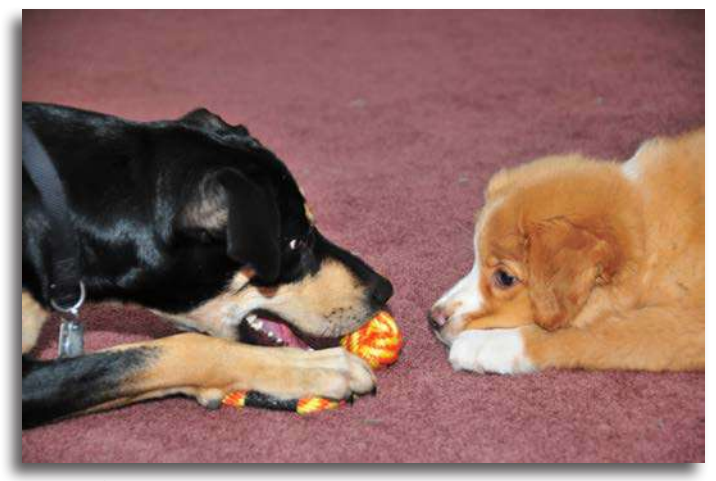
3<sup>rd</sup> "Toffee's First Play with Big Dog Karma" Don Eastman