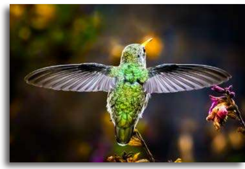
"Anna's Hummingbird in Front Yard"