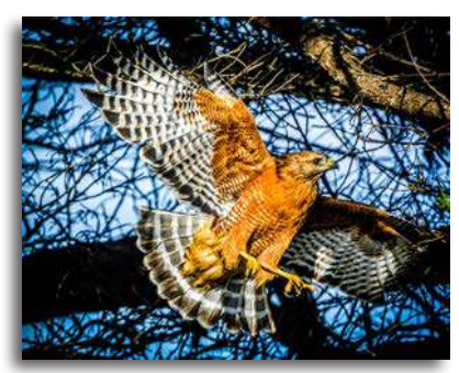
"Red Shouldered Hawk"